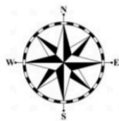
Unit 4 License Prep