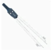
Unit 1 License Prep

CMTI offers USCG Deck License Exam Preparation for mariners at various levels of their careers. Select from our Test Prep options. See our License Exam Preparations page for more information.