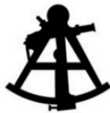
Unit 2 License Prep